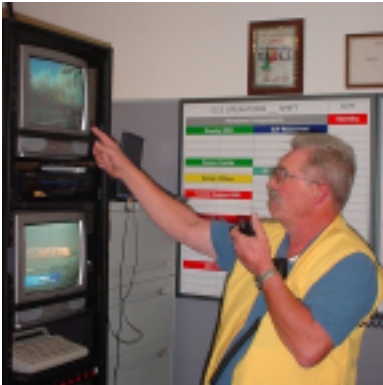
Forest fire seen at an EOC on the other side of the mountain via ATV.