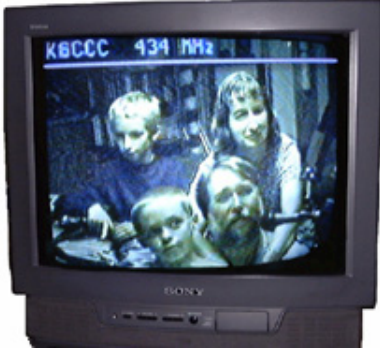
Show the family on ATV