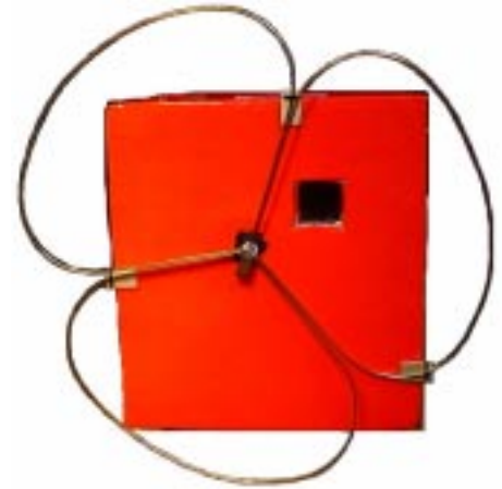
Big Wheel mounted to the bottom of a balloon payload - ATV camera looks down through hole.